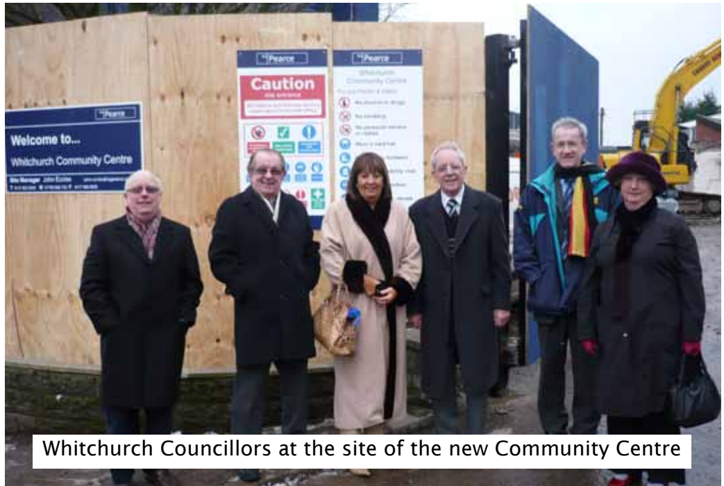
Whitchurch Councillors at the site of the new Community Centre